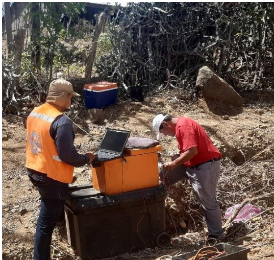
Sección geoelectrica 2D - El Tamarindo - Perfil 2